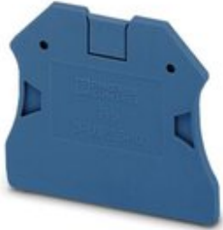
End cover, length: 47 mm, width: 2.2 mm, height: 39.8 mm, color: blue

Please be informed that the data shown in this PDF Document is generated from our Online Catalog. Please find the complete data in the user's documentation. Our General Terms of Use for Downloads are valid ( http://phoenixcontact.com/download )